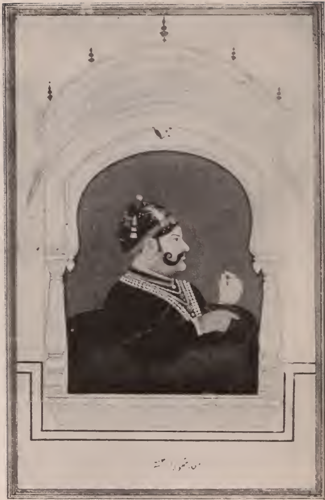
PORTRAIT OF PRITHVI-RAJA, IN THE JEYPORE KALM (EIGHTEENTH CENTURY).